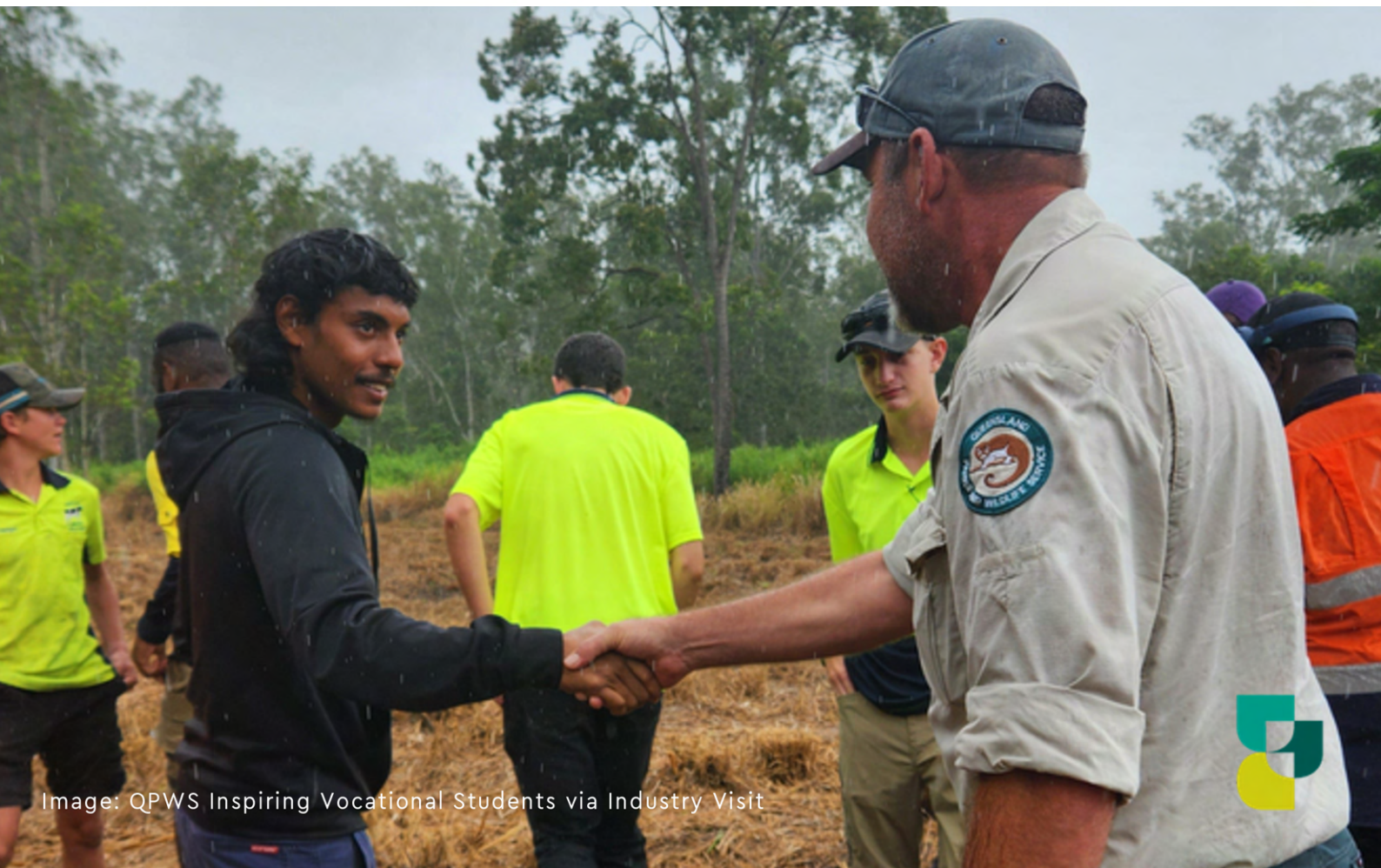
Image: QPWS Inspiring Vocational Students via Industry Visit

By providing these additional opportunities, we aim to bridge the gap between education and employment, ensuring our students are well-prepared for a successful transition into the local workforce.